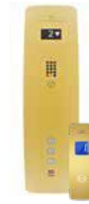
Polished (Mirror) Gold