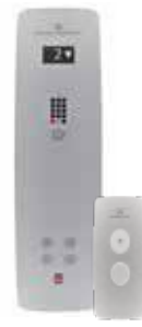
Polished (Mirror) Stainless Steel