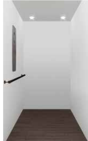
Melamine Panel (Optional)